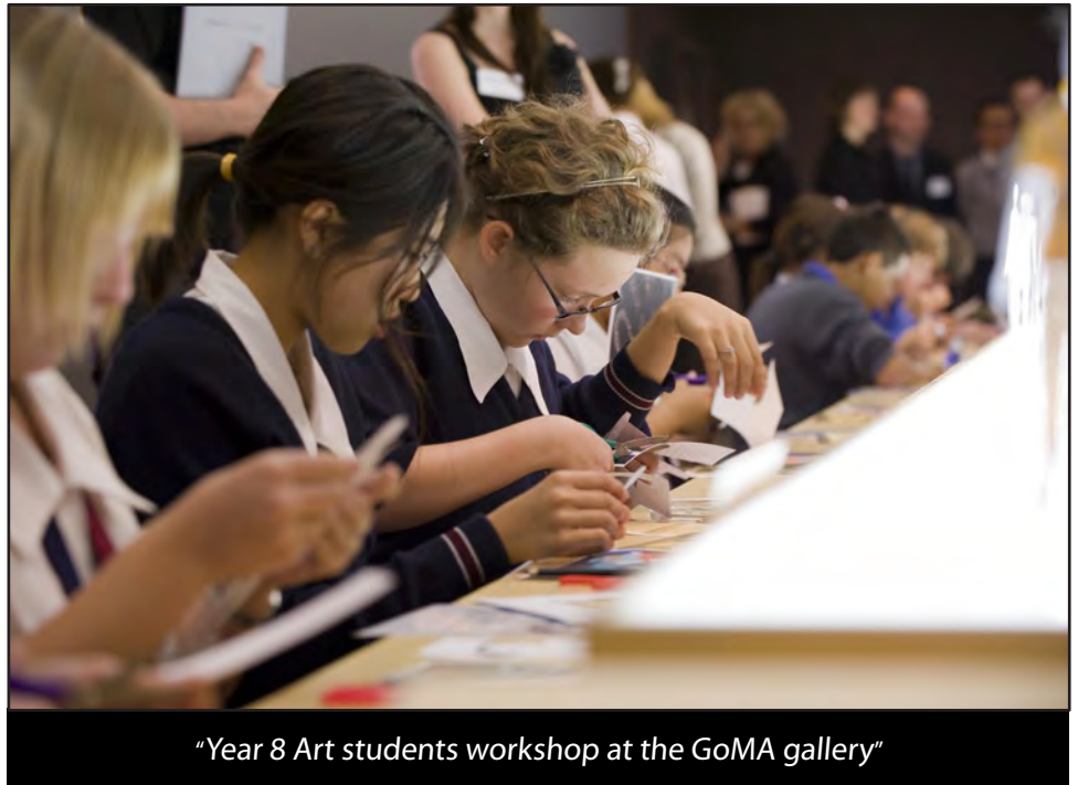
"Year 8 Art students workshop at the GoMA gallery"