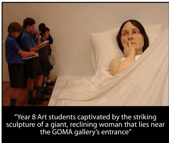
"Year 8 Art students captivated by the striking sculpture of a giant, reclining woman that lies near the GOMA gallery's entrance"

On August 21, a class of Year 8 Art students were treated to a special preview of a new show at the Gallery of Modern Art. The exhibition celebrates the work of Easton Pearson, a Brisbane-based and internationally acclaimed fashion house. The students spent the afternoon creating their own fashion collections in the GoMA Activity Centre while posing for a crowd of media photographers. Created with patterned paper and cardboard mannequins, the students' couture creations were a varied lot, ranging from the sublimely stylish to the freakishly bizarre. The students were also captivated by the striking sculpture of a giant, reclining woman (Ron Mueck's "In Bed") that lies near the gallery's entrance.