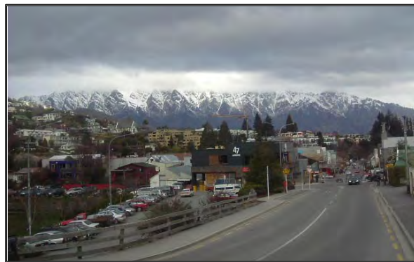
Queenstown, New Zealand