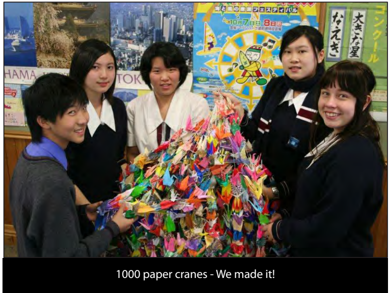
1000 paper cranes - We made it!